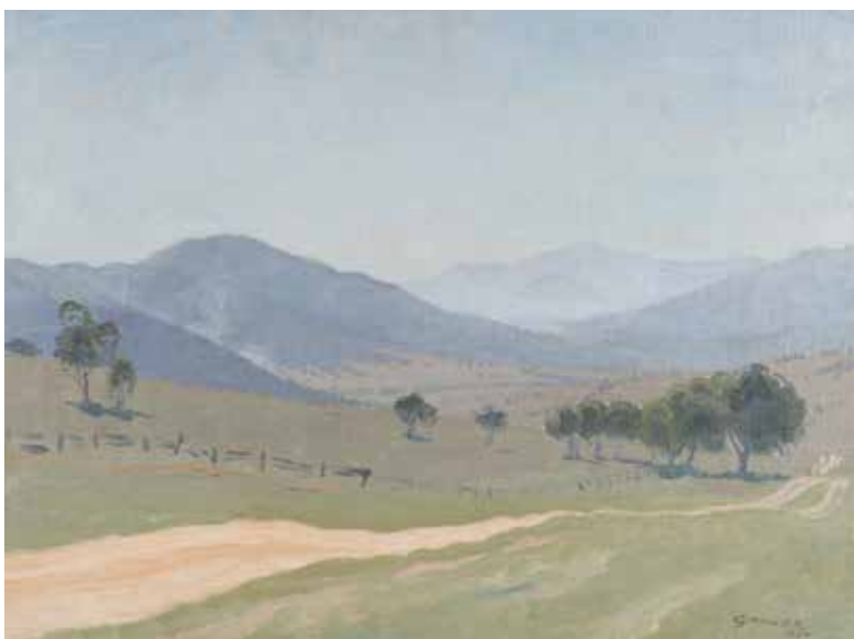
Elioth Gruner The dry road 1930 , oil on canvas on board, 29.4cm x 39cm

Gruner travelled widely in the Canberra region from the early 1920s until his death in 1939, and is one of the few artists to spend significant amounts of time working here. He painted many superb landscapes in the Southern Highlands, the Southern Tablelands, the Monaro plateau and the Murrumbidgee River valley. He was particularly struck by the clarity of the light in the region, and these paintings represent the best work of his mature style. Gruner painted substantially en plein air and the Canberra region works were largely produced while he enjoyed the hospitality of local farmers and graziers.