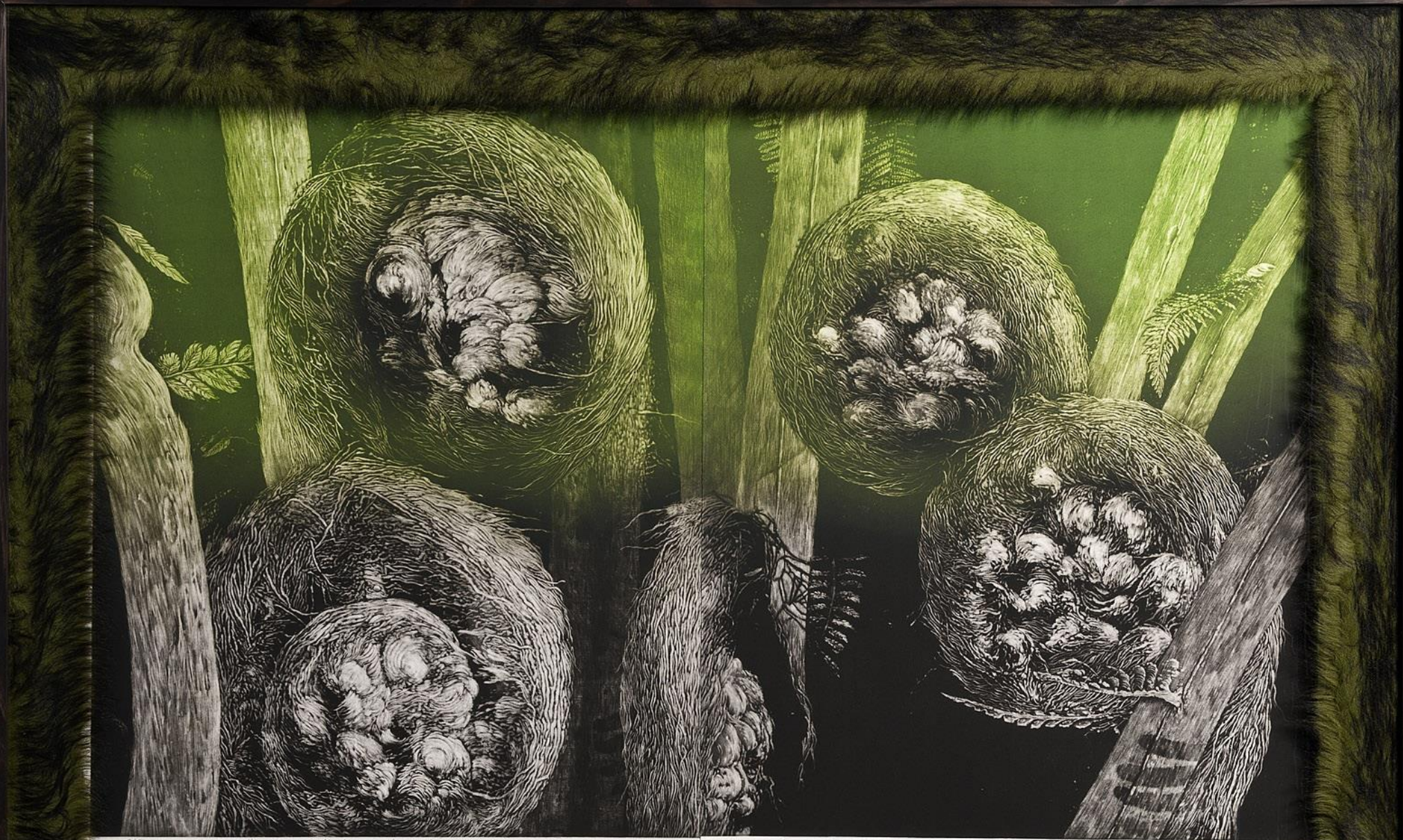
2711 / was sitting up near after ten see dry wood / saw (Jonathan Cooper)